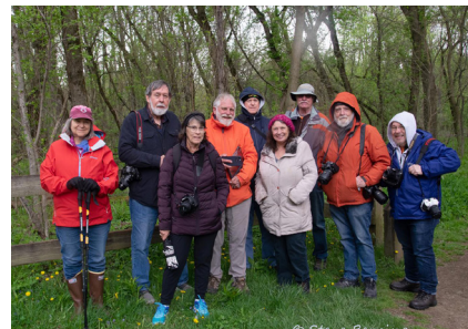
Duneland Photography Club Members at the Heron Rookery of the IN Dunes National Park for a wildflower photoshoot.