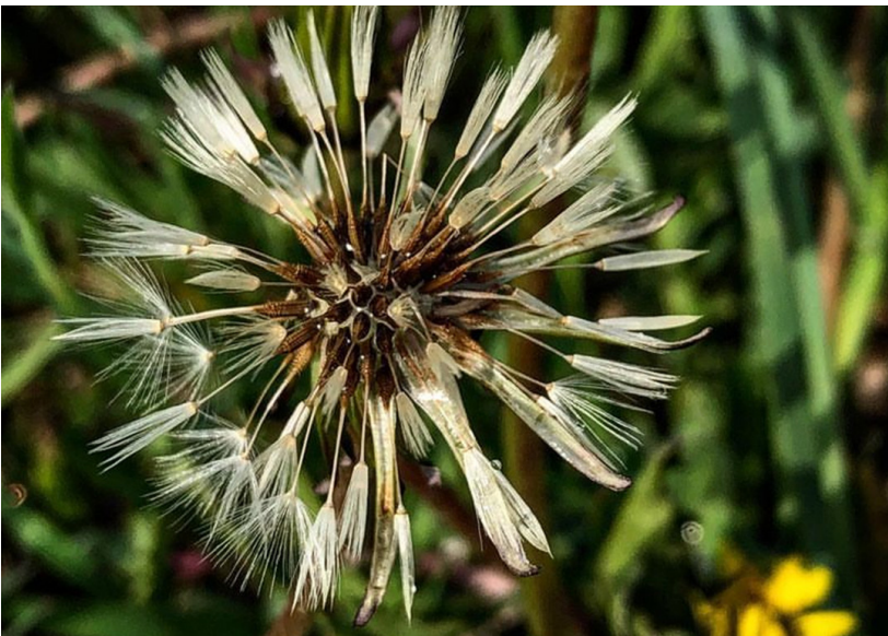
Advanced Digital Photography Workshop - June 24