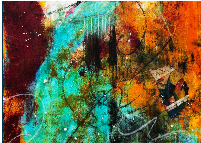
Abstract Oil Painting + Cold Wax Workshop - June 3

Tuition is $90 for non-members / $81 for current CAC members + supply list