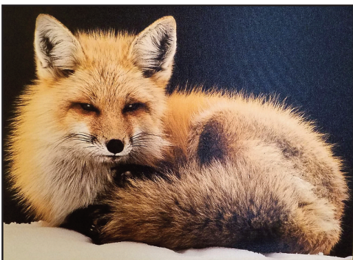
"Grand Teton Fox"

The Duneland Photography Club is also involved in community service. They are currently doing headshots for the Memorial Opera House in Valparaiso and taking photos for the Porter County Parks Department. For more information, check them out on Facebook at https://www.facebook.com/dunelandphotoclub/ or email DunelandPhotoClub@gmail.com .