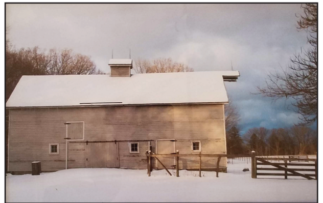
"Winter Peace" by Teresa D. McGinley

The group was founded in 2010 when the Shutterbug Club and the Taltree Photography Club combined forces. The club currently has about 70 members (with an average attendance of about 30 - 40 at each meeting). They have members from all over the Northwest Indiana area. The Duneland Photography Club meets the first Tuesday of each month at Sunset Hill Farm County Park in Valparaiso. They meet at 5:30 for mentoring and 7:00 for the regular meeting. Meetings generally consist of photography instruction and discussion using members and outside speakers. Typically, photo shoots, classes and other events are scheduled outside the regular meeting time. Visitors are welcome to attend their first meeting free. Yearly dues are $10 for an individual and $20 for a family.