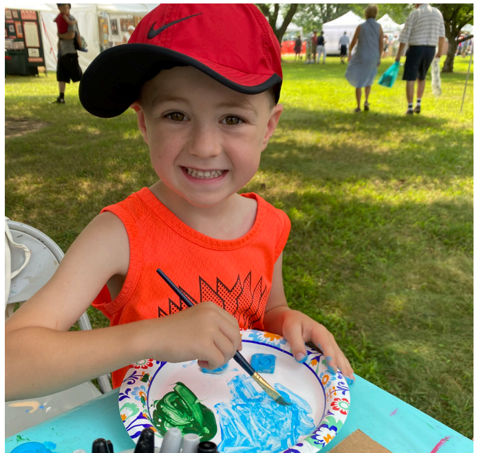
Young artist enjoying the Children's Art Experience booth