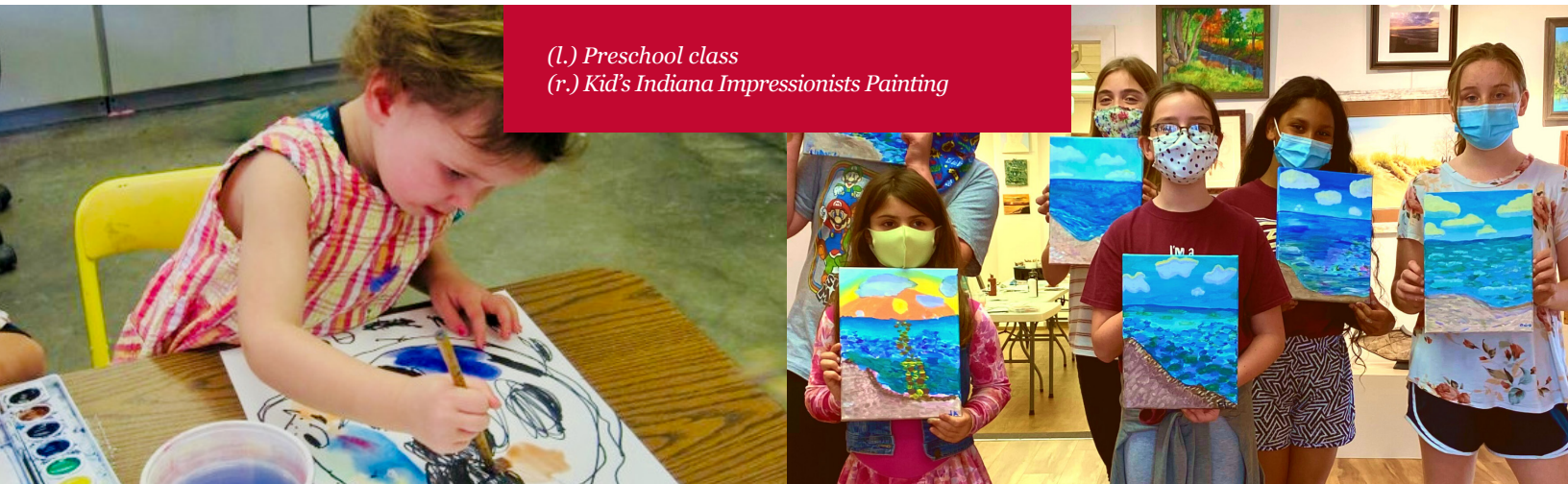
(l.) Preschool class (r.) Kid's Indiana Impressionists Painting

Masks are still required for on-site kids' classes at CAC regardless of vaccination status. Visit our website for our COVID-19 guidelines. There will be no make-up days for missed classes at this time.