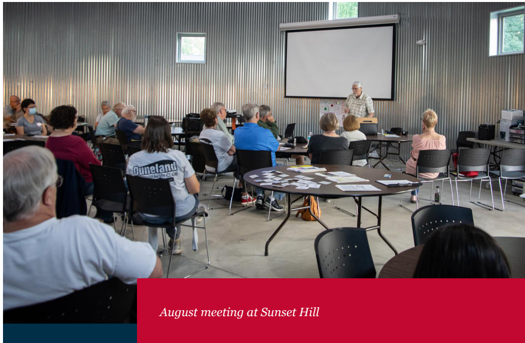
August meeting at Sunset Hill

There are a lot of local events coming up to photograph. On September 11th is the Popcorn Festival in Valparaiso. The weekend of the 18th and 19th is the Art Blitz at the Art Barn. The Duneland Photography Club has also scheduled a photoshoot at the Friendship Gardens in Michigan City on September 18th.