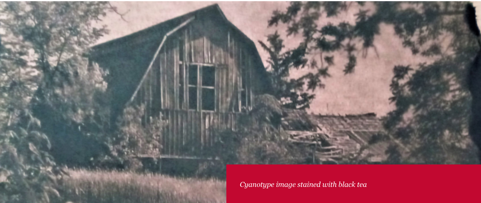
Cyanotype image stained with black tea

Our classes provide a creative space for artists to learn at every age and level.