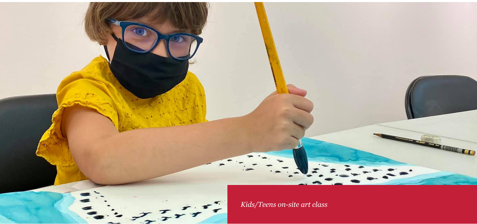
Kids/Teens on-site art class