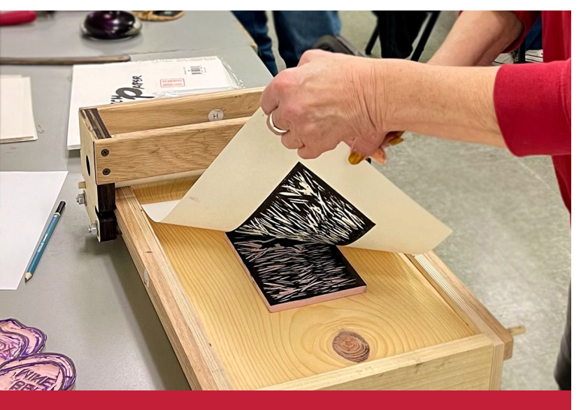
Exploring Printmaking Workshop - May 4

Our classes provide a creative space for artists to learn at every age and level.