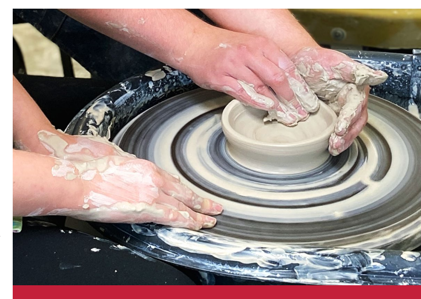
Partner Wheel Workshop - Starts May 4

Tuition is $125 for non-members / $112.50 for current CAC members, supplies included