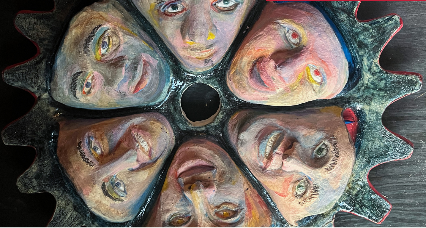
Emily Casella, The Wheel of Options , glazed ceramics (detail)