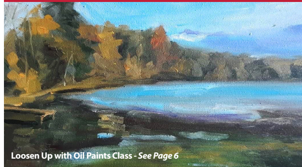
Loosen Up with Oil Paints Class - See Page 6