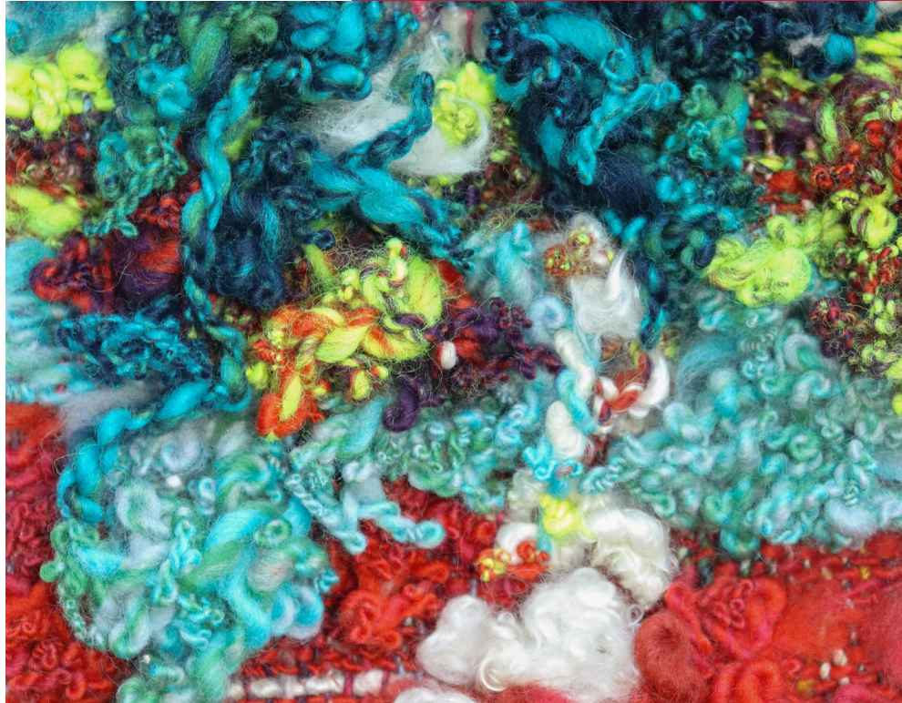
Bryana Bibbs, 11.22.20, 2020