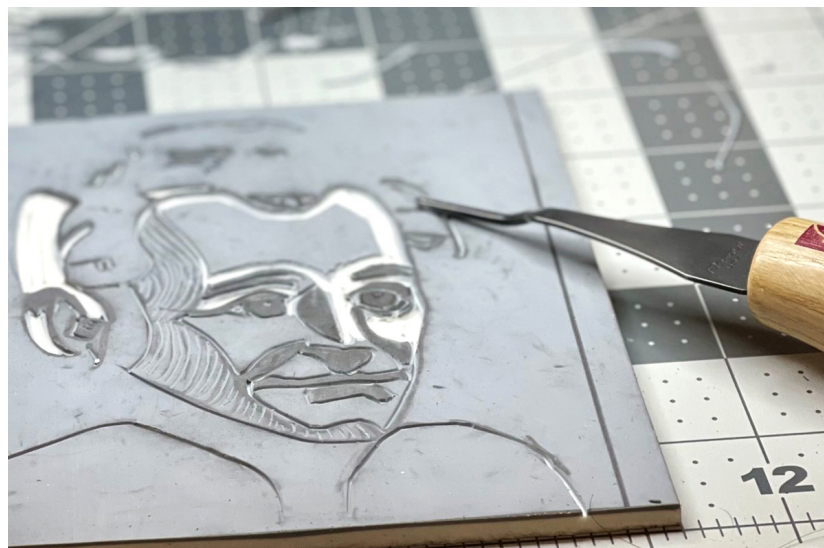
Relief Printmaking 101 - Starts January 10

Tuition is $90 for non-members / $81 for current CAC members + supply list