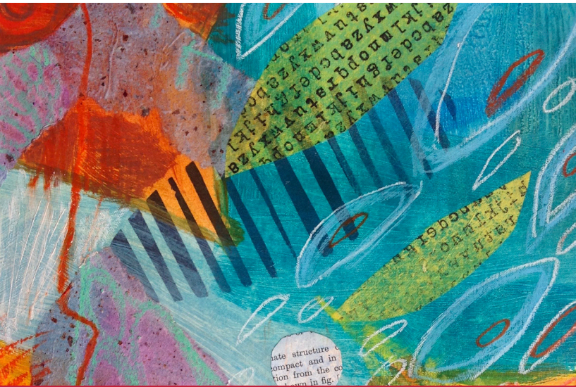
Mixed Media Collage Workshop - January 13

Our classes provide a creative space for artists to learn at every age and level.