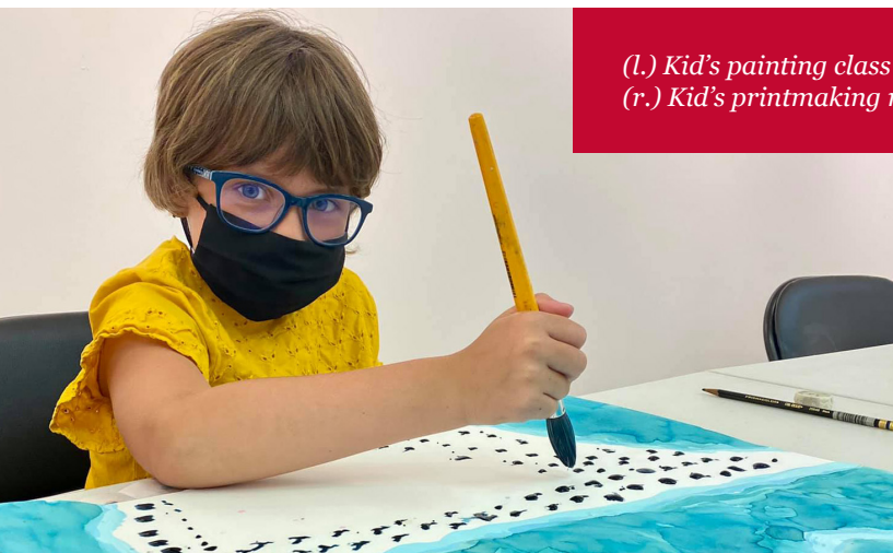
(l.) Kid's painting class (r.) Kid's printmaking results

Masks are still required for on-site kids' classes at CAC regardless of vaccination status. There will be no make-up days for missed classes at this time.