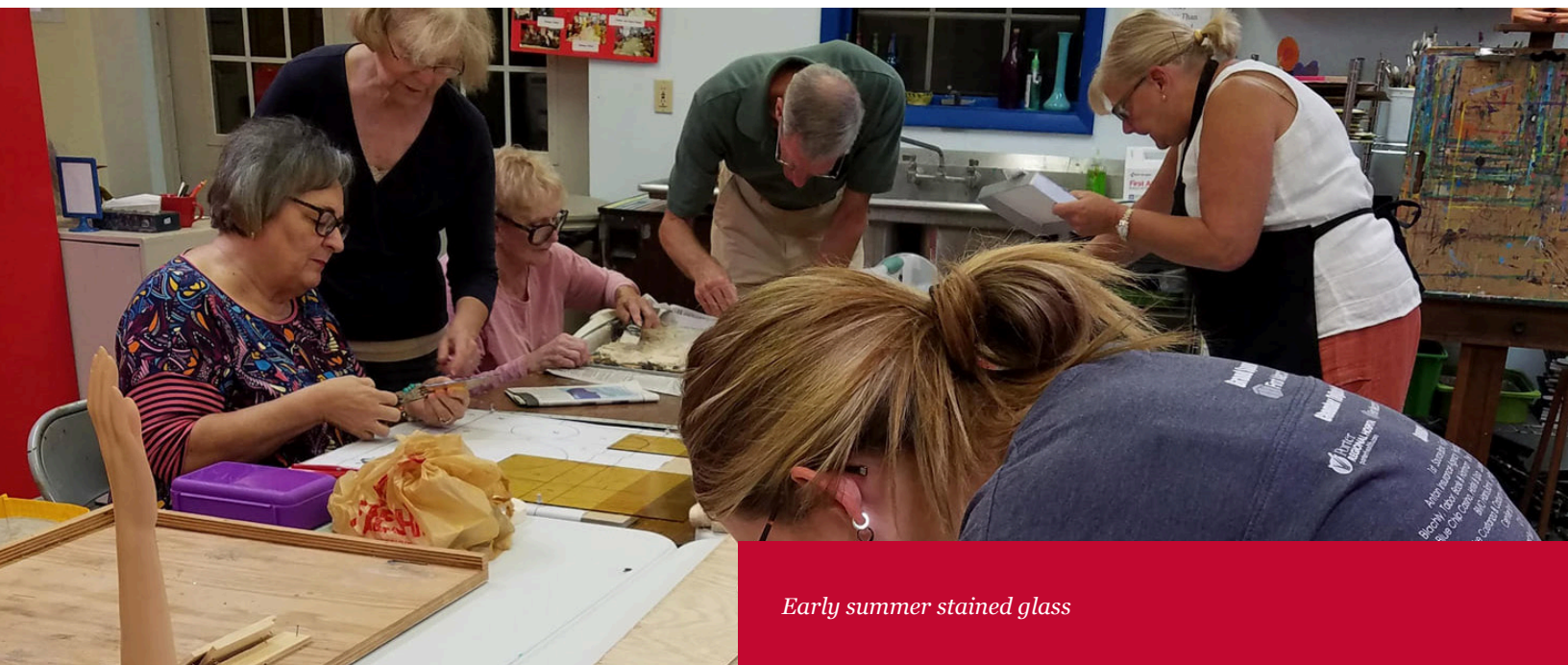
Early summer stained glass

Our classes provide a creative space for artists to learn at every age and level.