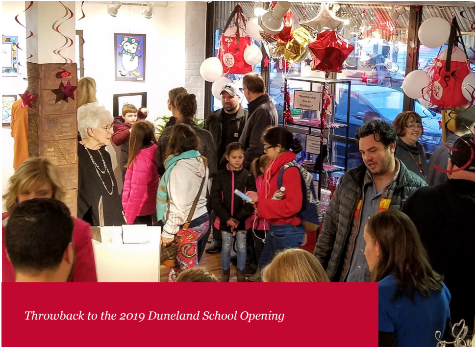
Throwback to the 2019 Duneland School Opening