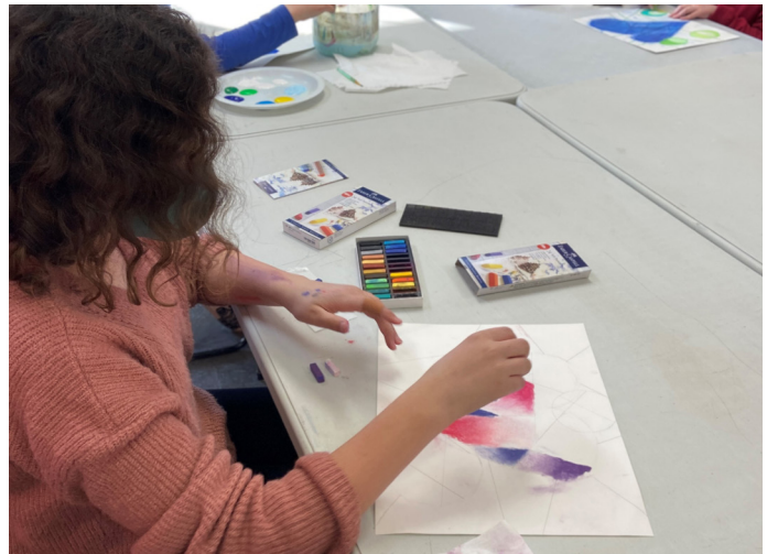
Student exploring modernism and color theory

April brings more than spring showers to CAC! Our weekday youth art classes will be focusing on Surrealism - a movement that's all about the mind. With influences from artists like Salvador Dali and René Magritte, students will be challenged to bend the rules and harness their imagination as they create artwork sourced from their dreams.