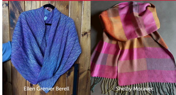
Ellen Grenier Berell