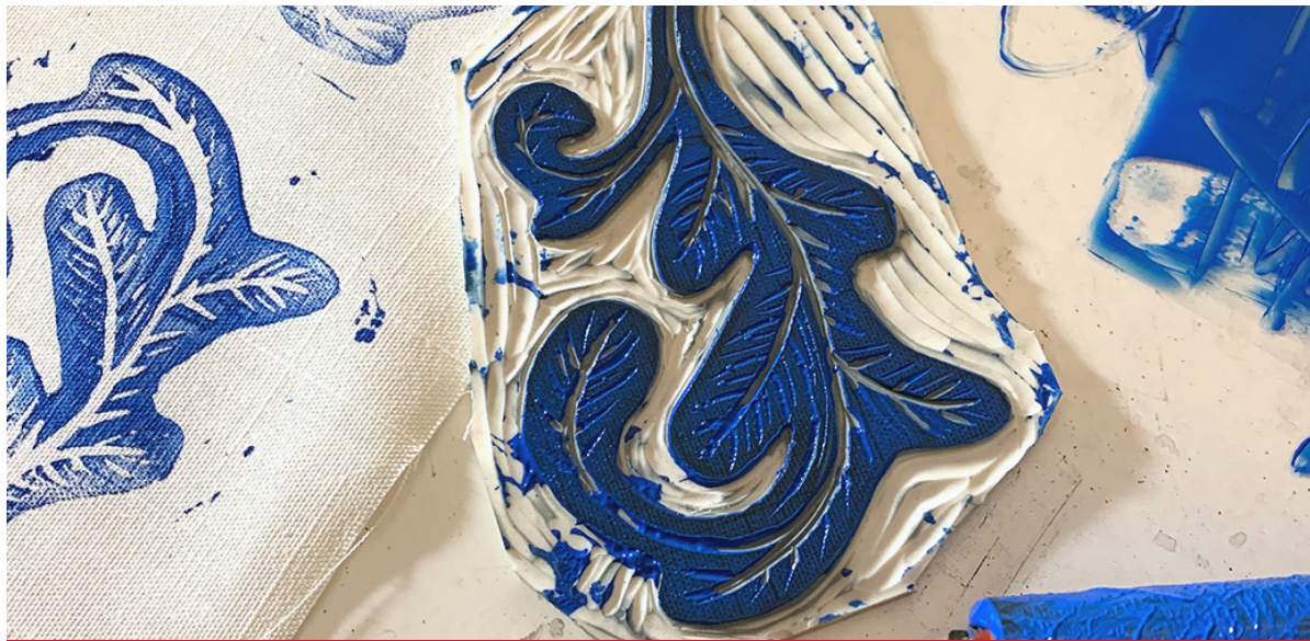
Fabric Block Printing Workshop on April 15

Tuition is $65 for non-members / $58.50 for current CAC members