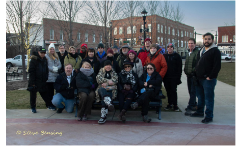
Duneland Photography Club Members preparing for a recent bluelight / nighttime photoshoot in downtown Valparaiso.