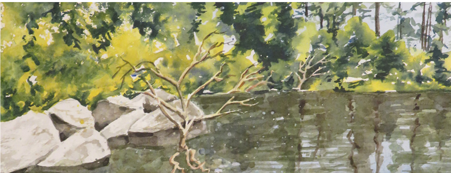
Water & Trees Watercolor Workshop on April 13